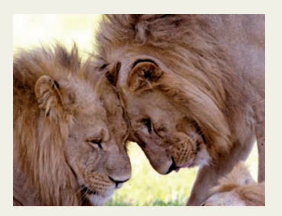
The KAZA TFCA is home to Africa's charismatic "Big Five"; elephant, leopard, rhino, buffalo and lion. Over the past 50 years, wild lion numbers in Africa have decreased from over 200,000 to less than 20,000 today, mostly because of habitat loss and human animal conflicts. KAZA is one of the remaining strongholds for lions.

The Kavango Zambezi conservation area encompasses a total of 36 national parks, wildlife reserves and conservancies. These include the Caprivi Strip with its wetlands and wildlife-rich conservancies in the north-east of Namibia, the Okavango Delta, the vast Chobe National Park in northern Botswana, and the magnificent Hwange National Park located near the mighty Victoria Falls in Zimbabwe, a World Heritage site and one of the seven Wonders of the World.