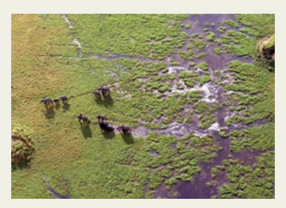
A heard of elephants in the Okavango delta.