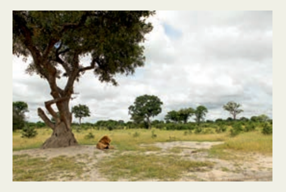
The KAZA TFCA is richly endowed with a diversity of habitats. Four main structural vegetation types are recognized,

Dry forest, which is very localized in the north, various types of woodland (Baikiaea, miombo, mopane, Acacia) covering the greatest portion of the area, grassland and wetlands.