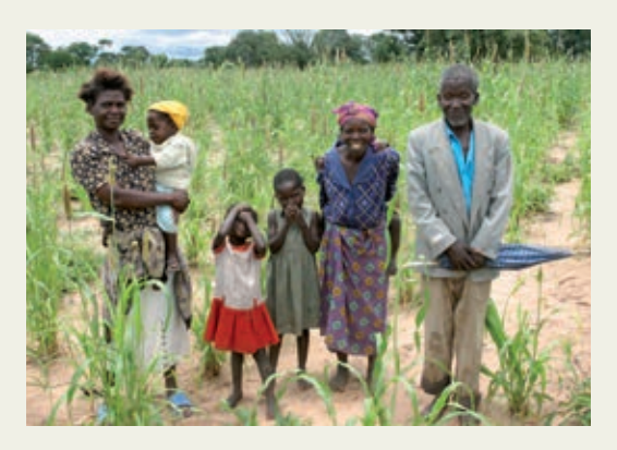
Subsistance farmers benefit from conservation agriculture, which increases yields and maintains soil fertility.